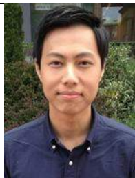
Rickey Lu GICICRST1602054

Keywords: Ceriops decandra , mosquito larvicidal activity ,mosquito repellent